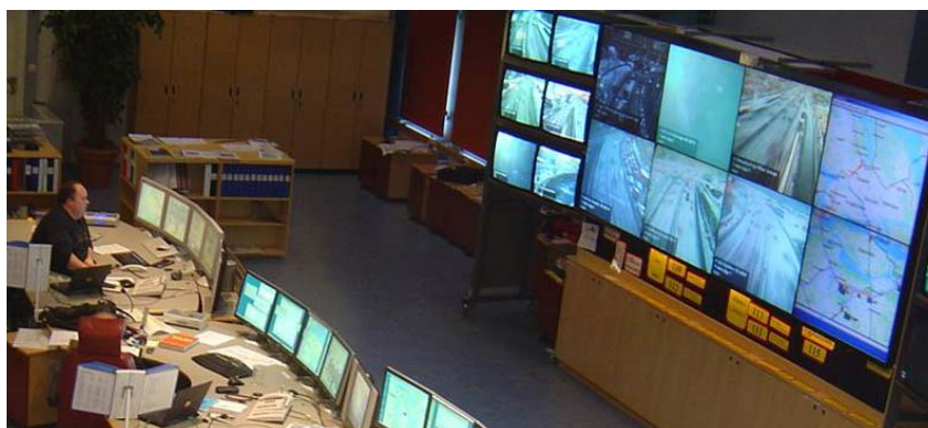
Congestion charging control room in Stockholm

The main phases of the project started in Dec-05: three 'cycles' of Study Tours and Staff Exchanges, where the partners send delegations to visit each other (and other cities too).